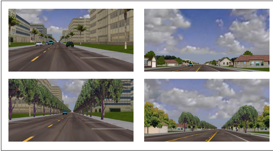
Figure 1. The center pane of the simulation pairs used for the drive-through shows the difference with and without curbside street trees.

measuring their color, texture, line and form throughout the seasons. Driver perception is manipulated by the edge of the visual environment affecting the scale, proportion and rhythm of the driving experience. Berlyne observed how different levels of visual complexity affect attention and alertness. 12