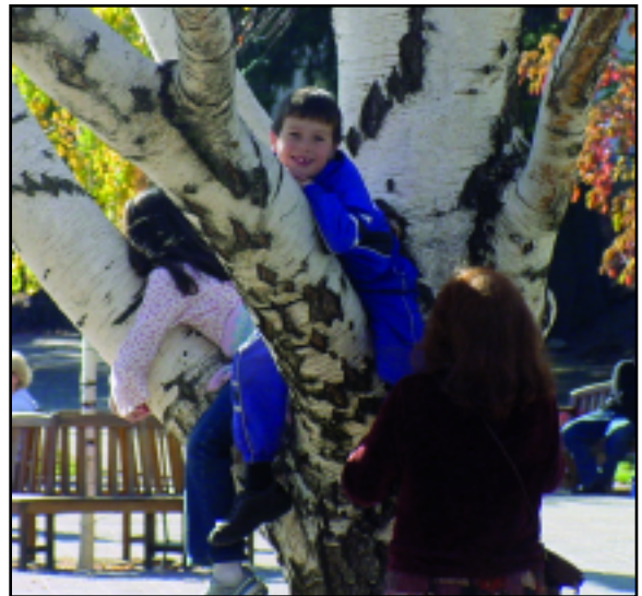
Trees and nature are an important element of outdoor environments that support physical activity.