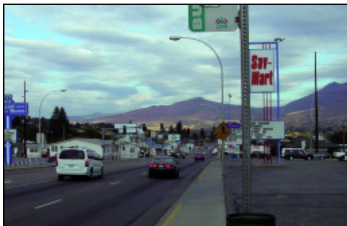
People are likely to avoid walking in areas where there are no natural features, such as trees.

Also, people make more walking trips to task destinations (such as stores or coffee shops) when they perceive that there are many natural features in their neighborhood, including street trees. In less green neighborhoods, people judge distances to be greater than they actually are, perhaps leading to decisions not to walk.