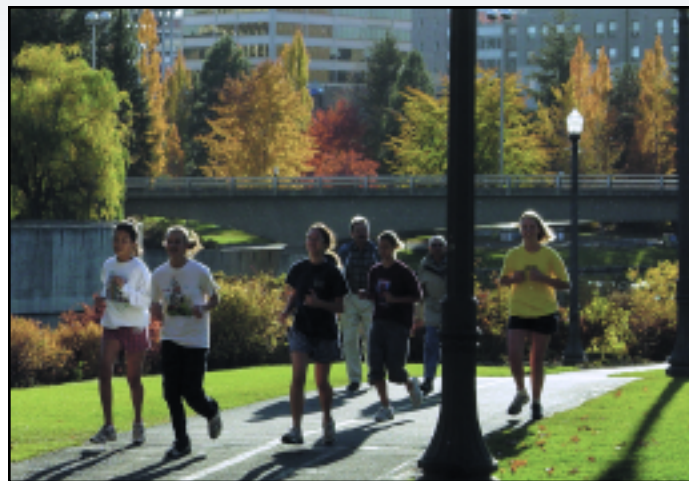
Evidence suggests that parks and open space encourage physical activity.

characteristics of potential users (age, gender, ethnicity, socioeconomic status) match between park attributes and perceived needs perceived barriers safety from crime aesthetic features (presence of trees, water, birdlife)