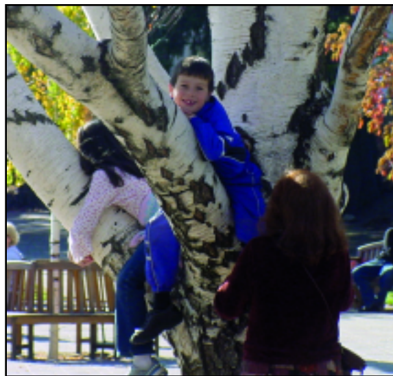
Trees and nature are an important element of outdoor environments that support physical activity.